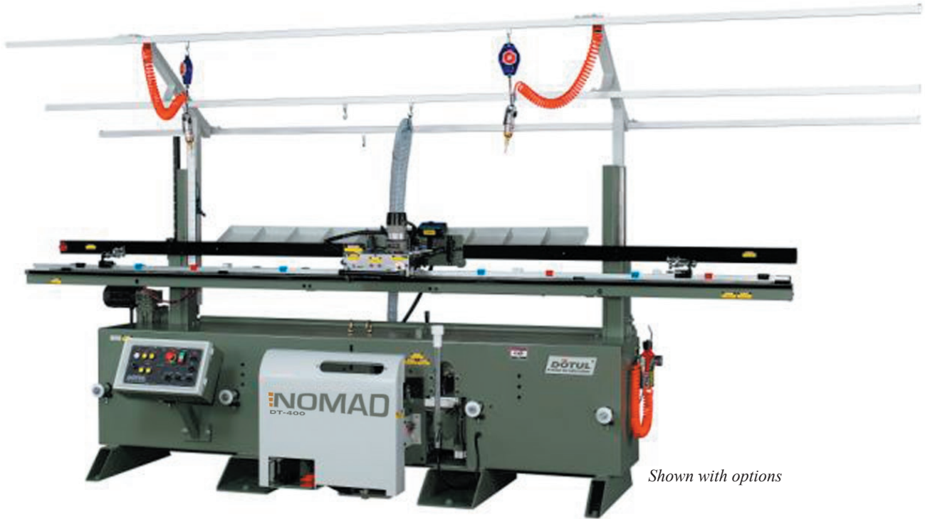
Shown with options