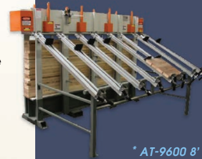
AT-9601 pictured above